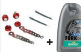
Kit contains: 1 valve kit + 1 litre of RACING FORK oil