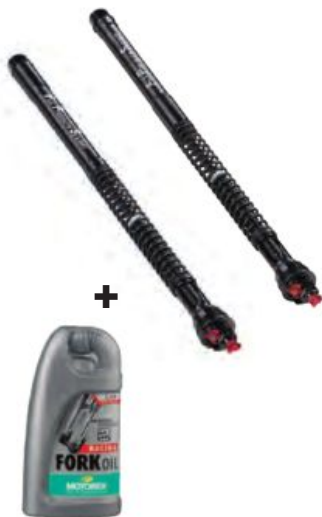
Kit contains: 2 cartridges + 1 litre of RACING FORK oil