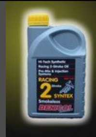
RACING 2 SYNTEX