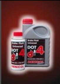
BRAKE FLUID DOT 4