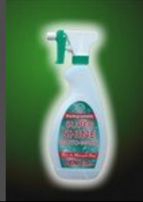
SUPER SHINE MOTO WASH