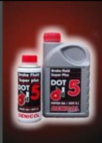
BRAKE FLUID DOT 5.1