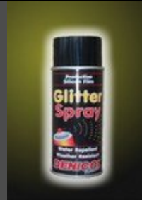
GLITTER SPRAY AEROSOL