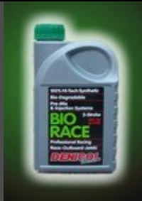
BIO RACE 2-STROKE