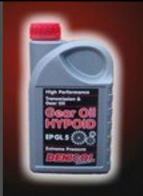
GEAR OIL HYPOID EP 80W90