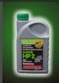
SUPER HP 2