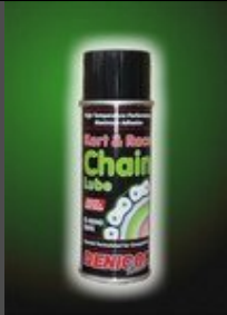
KART & RACE CHAIN LUBE