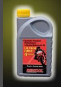
ULTRA BIKE 10W40, 15W50