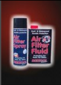
AIR FILTER FLUID & SPRAY