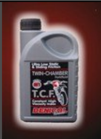
TCF FORK FLUID