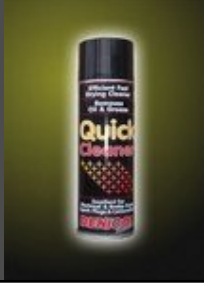
QUICK CLEANER AEROSOL