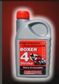
BOXER 4-STROKE 15W50