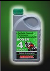
BOXER SYN 4-STROKE 15W50