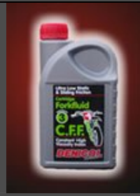
CFF FORK FLUID NR 00,0,01,1,2,3,4