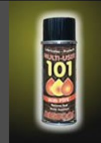
MULTI USER 101 AEROSOL