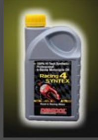
RACING 4 SYNTEX 10W40, 5W50, 15W50