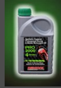
PRO 2000 10W40, 15W50