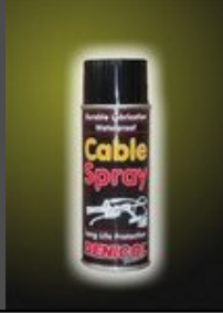
CABLE SPRAY AEROSOL