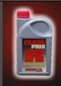
GRAND PRIX RACING