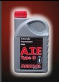
ATF TYPE D