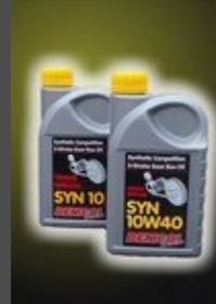
TRANS SPECIAL SYN SYN 10W40