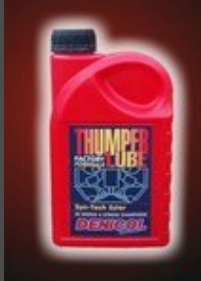
THUMPER LUBE 10W40, 10W50, 15W50, 10W60