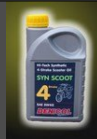
SYN SCOOT 4-STROKE 5W40