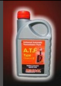
ATF TYPE DEXRON III