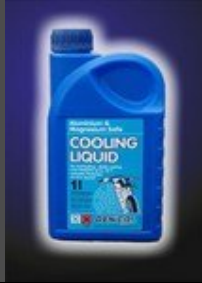
COOLING LIQUID MOTO