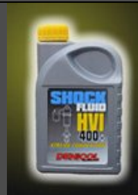
SHOCK FLUID HVI 400