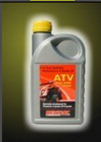
ATV QUAD 10W40, 15W50