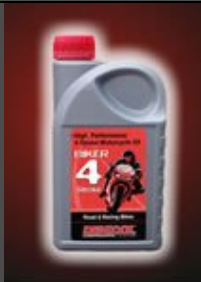
BIKER 4-STROKE 10W40, 15W40, 15W50, 20W50