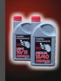
TRANS SPECIAL LIGHT 10/15 MEDIUM 15/40