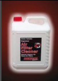
AIR FILTER CLEANER