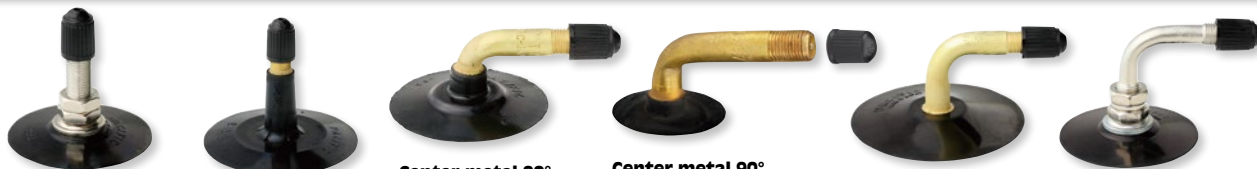
Center metal center or side position TR4/TR6/TR6S